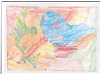
Colours of my Heart