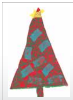
Christmas Tree (2)

Christmas Series: Set of 8 cards, 4 each of the above designs, with 8 envelopes