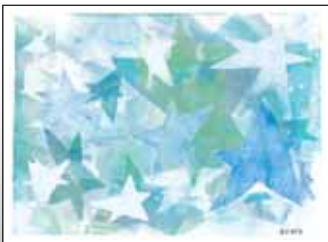
You're a Star

Series 1: Set of 8 cards, 2 each of the above designs, with 8 envelopes